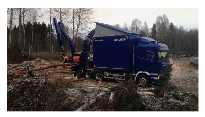
MOBILE CHIPPER 806.2 PTC TRUCK